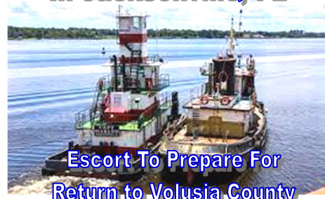
Escort To Prepare For Return to Volusia County