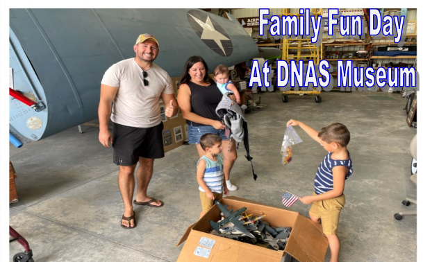
Family Fun Day At DNAS Museum