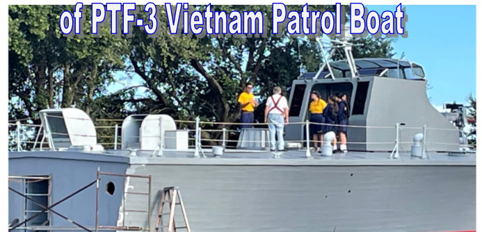
of PTF-3 Vietnam Patrol Boat