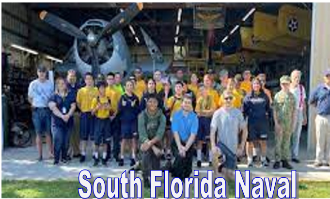
South Florida Naval