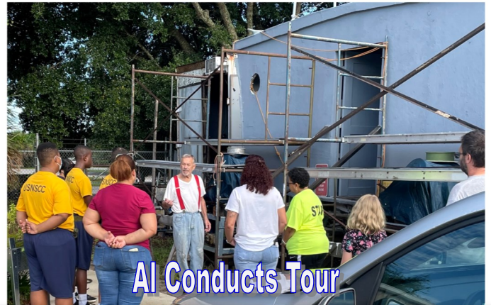
Al Conducts Tour