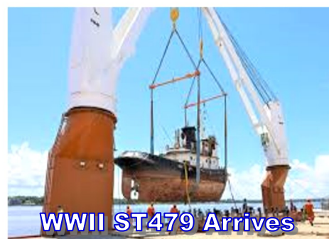
WWII ST479 Arrives In Jacksonville, FL