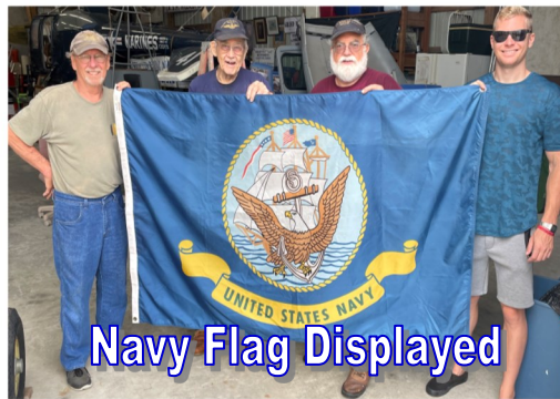
Navy Flag Displayed