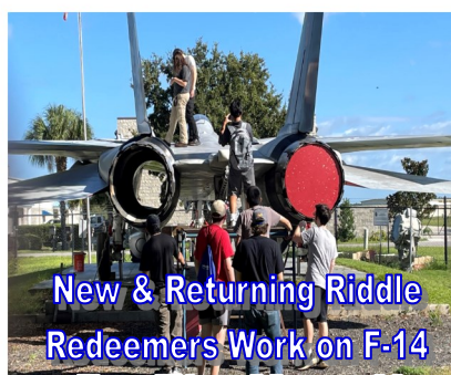
New & Returning Riddle Redeemers Work on F-14