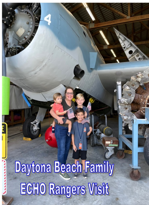
Daytona Beach Family ECHO Rangers Visit