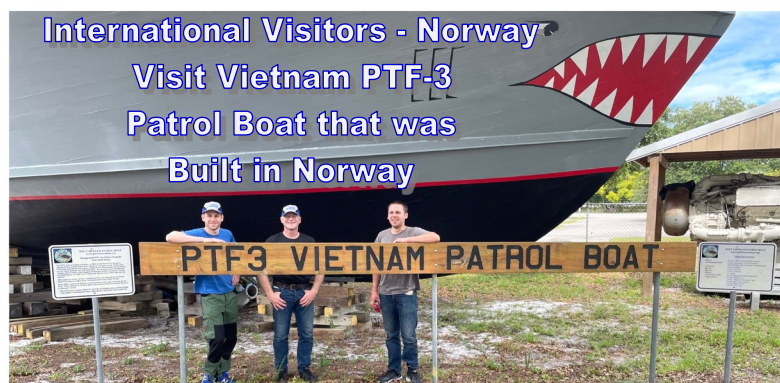
International Visitors - Norway Visit Vietnam PTF-3 Patrol Boat that was Built in Norway