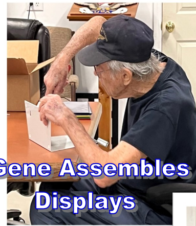
Gene Assembles Displays