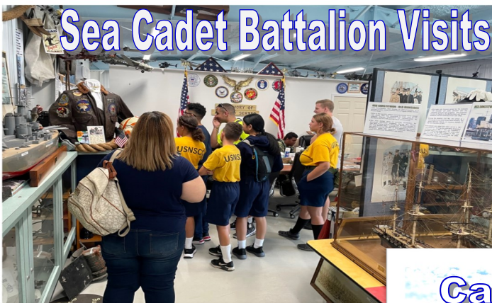
Sea Cadet Battalion Visits